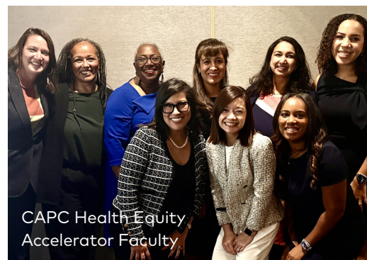
CAPC Health Equity Accelerator Faculty

Health Equity Champions Joined Monthly Office Hours for Peer-To-Peer Problem Solving and Support