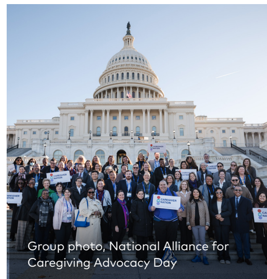
Group photo, National Alliance for Caregiving Advocacy Day

Because Medicare is the primary insurer for people with serious illness, CAPC prioritizes federal legislation and regulation that improves care quality for Medicare beneficiaries. In 2025, we collaborated with advocacy partners and organizations to submit 26 comment letters addressing issues such as protecting payment for virtual health care, advancing Age-Friendly hospital incentives, and standardizing clinical assessments for beneficiaries with serious illness, and their caregivers.